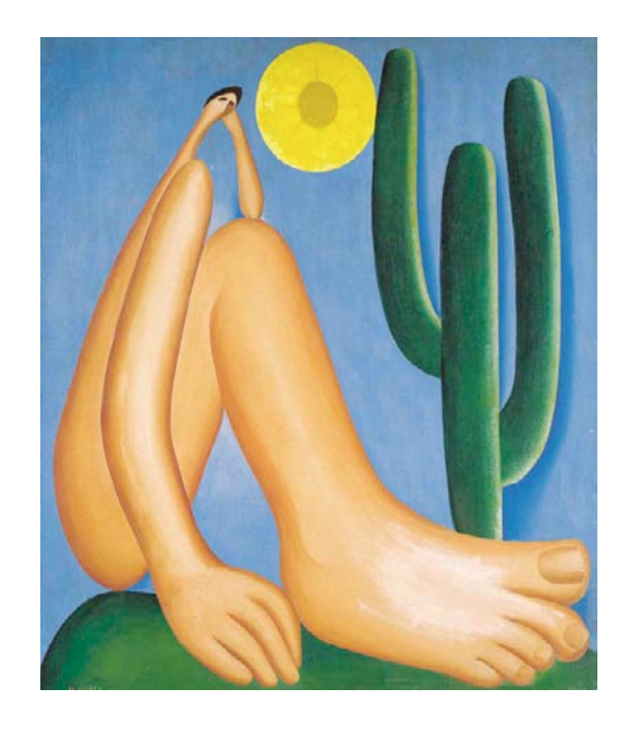
FIG. 1. ABAPORU, THE "MAN WHO EATS HUMAN FLESH" HAS STRONG ARMS AND FEET. TARSILA DO AMARAL (1928).

ered to be anti-modern practice, was thus converted into low wage employment - a legal, but not practical, freedom. Modernism worked to integrate African-Brazilians, and other ethnic groups, through a multiculturalist discourse, which didn't offer any practical option other than to maintain the current economic structure.