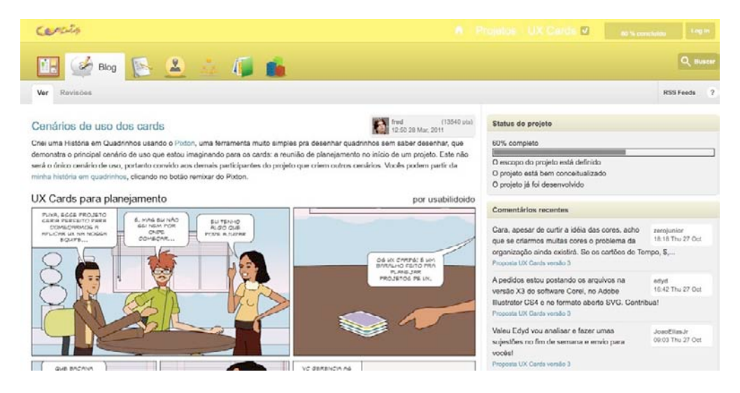
FIG. 4. DISCUSSING THE EXPERIENCE OF A CARD GAME THROUGH COMIC STYLE STORYBOARD IN CORAIS PLATFORM (2011).

learn something new, come back to the project, and apply it immediately. Another possibility is to start from the general description and see all the linked projects, giving a rich set of examples of the knowledge in action. Currently, there are dozens of wiki pages on methods for including users that would not be interested or knowledgeable enough to partecipate in Corais by themselves, like Focus Groups, Usability Testing, Future Workshops, and Ethnographic Study.