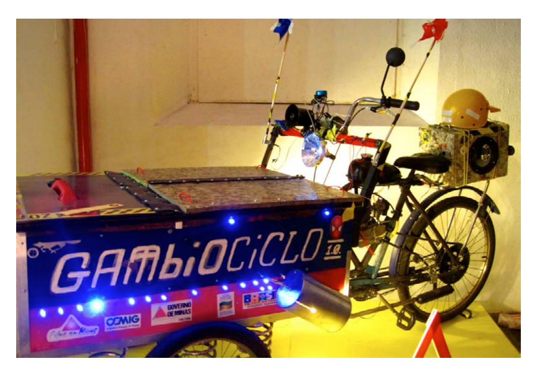
FIG. 3. GAMBIOCICLO, A PORTABLE DIGITAL GRAFITTI PROJECTOR BY GAMBIOLOGIA GROUP, ONE OF THE ARTISTS OF THE GAMBIÓLOGOS EXHIBITION (2010).

Free Software, Creative Commons and Collaborative Media became widespread in Brazil. The popular practice of gambiarra (kludging) and jeitinho brasileiro (how brazilians call their loose way of solving problems) were resignified in face of hackerism and collaboration from the pervading global digital culture (Boufleur, 2006). In spite of not having an overall theoretical background, gambiarra and jeitinho can be seen as profoundly apt counterparts to certain treats of hacker culture, specially the hands on approach. In 2010, the exhibition Gambiólogos attracted a lot of international attention to Brazilian artists working with gambiarra tactics (Figure 3). Gilberto Gil believes that Brazilians have discovered a way to live with contradictions that is terribly suited for current global economic instability: