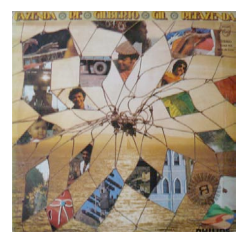
FIG. 2. THE COVER OF REFAZENDA MUSIC ALBUM SHOWS GILBERTO GIL EATING JAPANESE FOOD WITH AN EUROPEAN ROBE SURROUNDED BY A NETWORK OF INFLUENCES AND MEMORIES OF TRAVELING (1975).